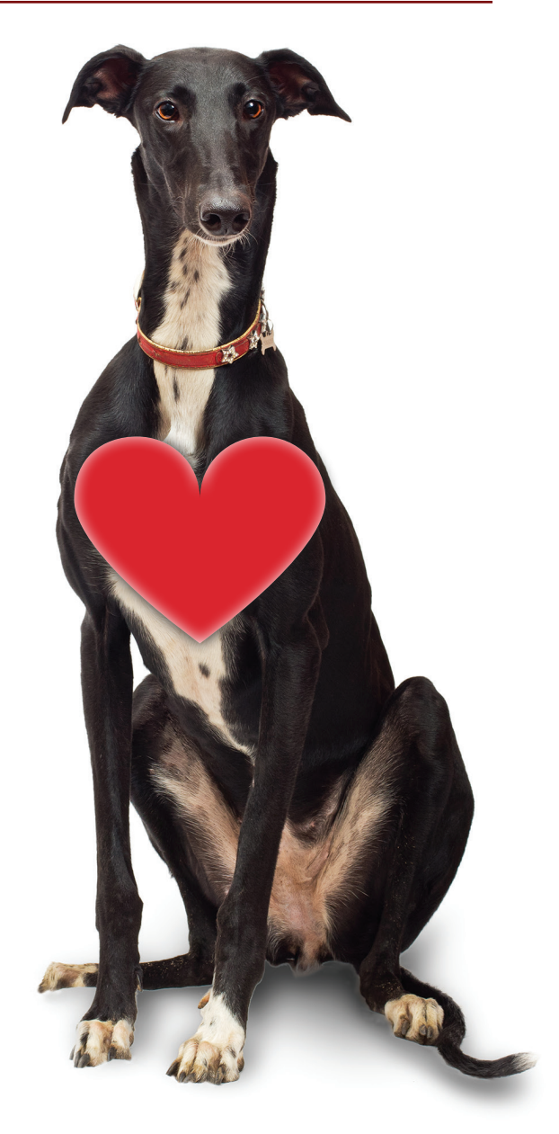
Keep Them Safe. Love Them Always.

Prepared by the American Heartworm Society and the Association of Shelter Veterinarians